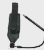
■ 94ACC0133 Hand Strap (Included with purchase)