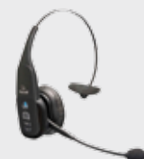
■ 95ACC0002 Bluetooth® Headset VX1 B350-XT